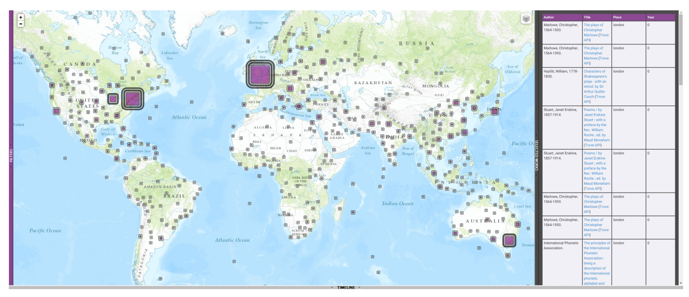
Fig. 1. Visualization of the Trove dataset [1] consisting of about 60 million records in GlamMap.