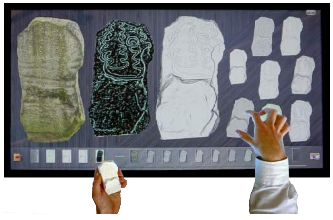
Fig. 2. A touch table-top display and tangible interactions of alternative-representations of the Pattern Stone at Bryn Celli Ddu [13].

Archaeologists use their experience and tacit knowledge obtained from other excavations to interpret the information they are presented with. They devise narratives to argue their interpretations. Often leaps-of-faith still need to be made by drawing on and trusting their own experience and body-of-knowledge that has been built up over years of working in the area. Much of this information is tacit and