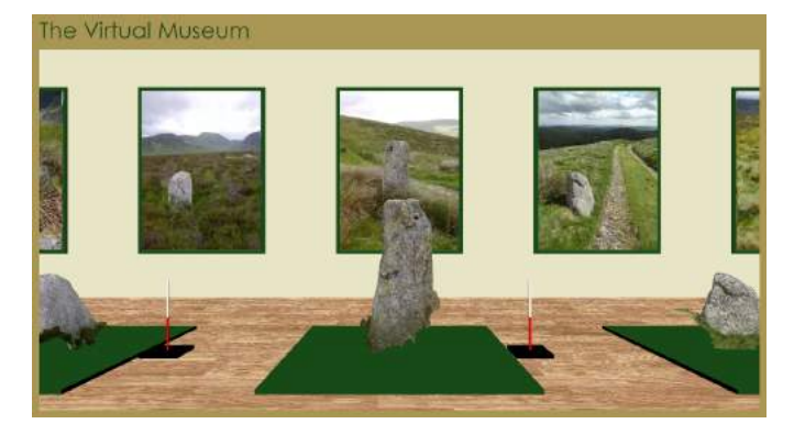
Fig. 3. Standing stones and other pre-historic monuments are displayed in a gallery interface. Users can walk in the 3D world to explore these different sites. The museum uses the models collected by citizen science from the heritageTogether.org project [17].

is not explicitly stored or easily exchanged between experts and, in particular, towards learners. As a result, justifying these hypotheses is often difficult without a clear sensemaking process. Moreover, it is sensible to investigate surveys from many locations (integrating data from many databases) and interpretations from other experts, such to gain the best (perhaps most certain) view.